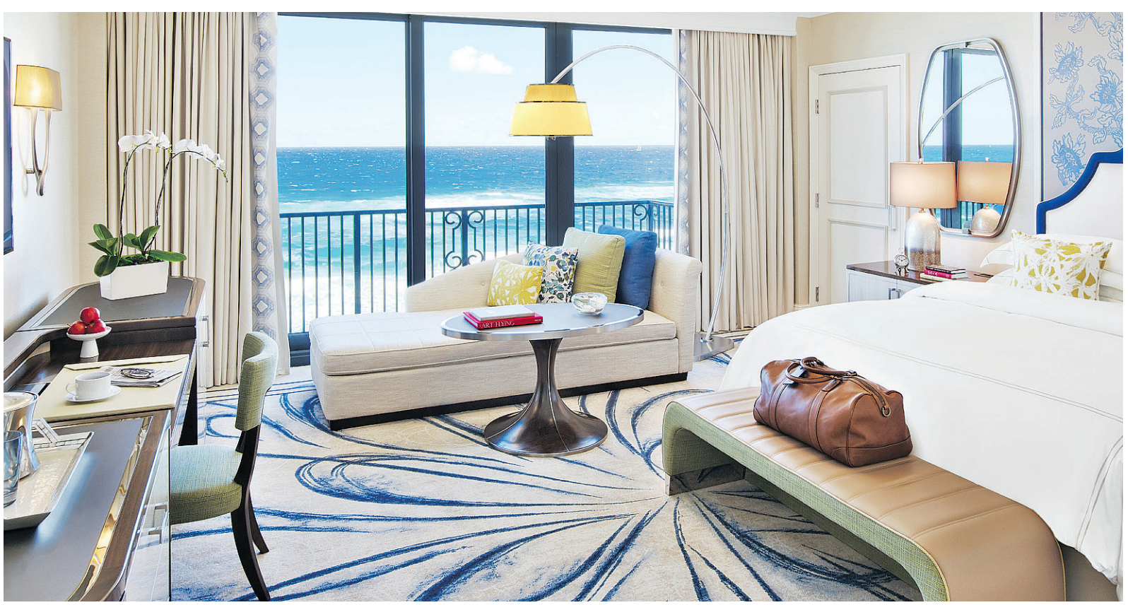
The Breakers' oceanfront tower accommodations recently were redecorated in colours of the sea and sky. Photos: The Breakers PALM BEACH